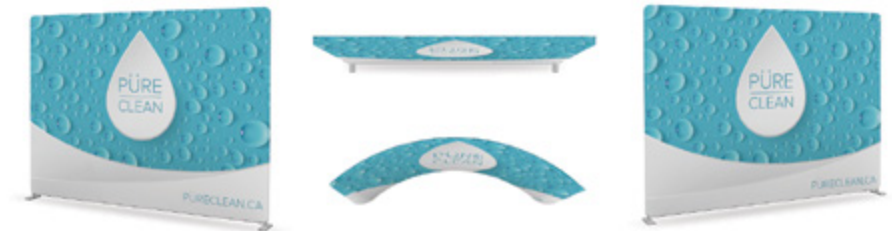
CURVED VERSION AVAILABLE

Available in single-side print and double-sided print options, this deluxe product makes the perfect trade show booth backdrop. It's easy to assemble and the fabric portion easily slips onto the frame for a hassle-free set-up.