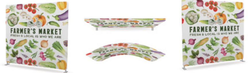
CURVED VERSION AVAILABLE

Available in single-side print and double-sided print options, this deluxe product makes the perfect trade show booth backdrop. It has an easy to assemble frame and the fabric portion simply slips on for a hassle-free set-up.