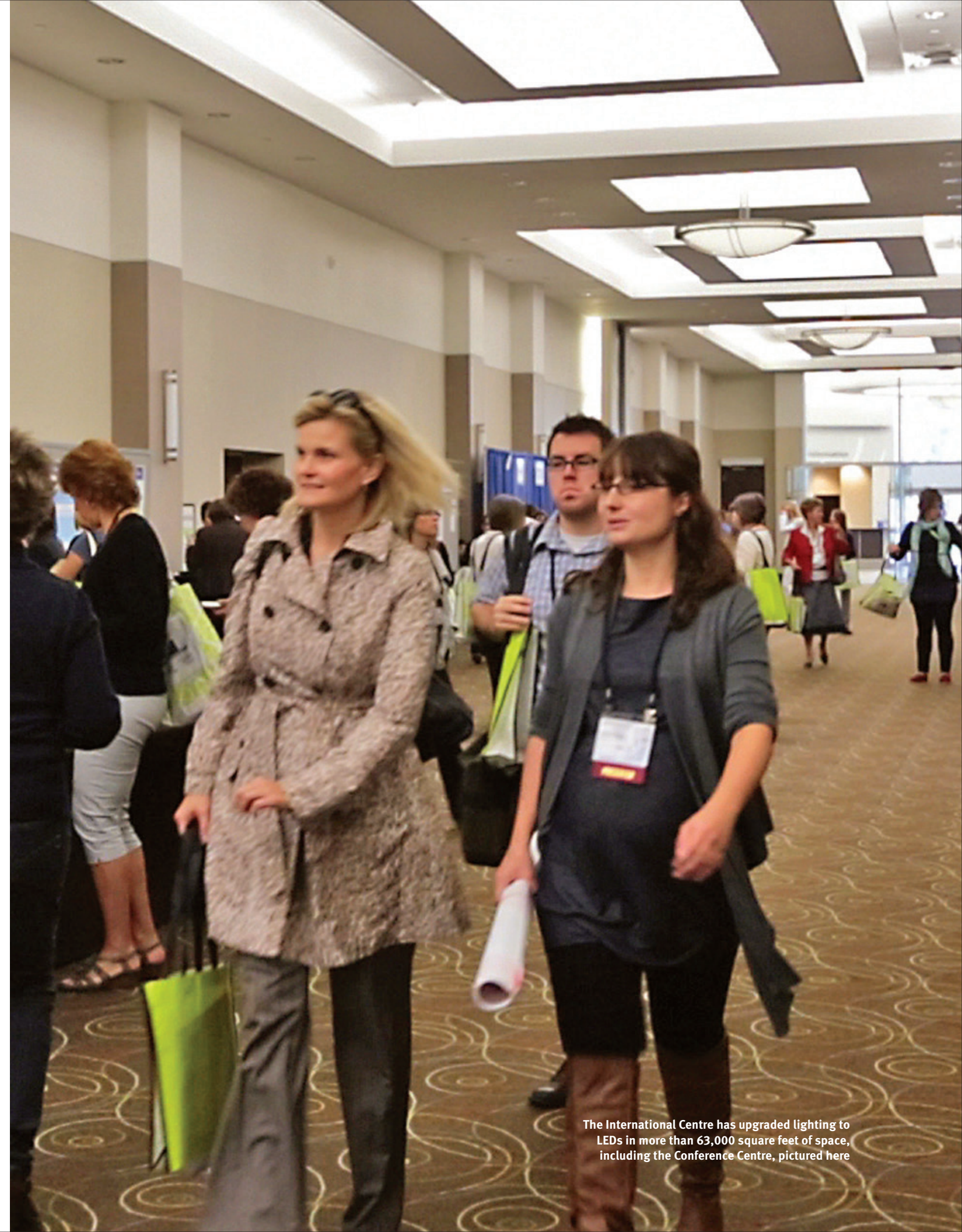
The International Centre has upgraded lighting to LEDs in more than 63,000 square feet of space, including the Conference Centre, pictured here

The International Centre is continuously striving towards energy efficiency, including the Conference Centre's lighting upgrade to LEDs resulting in annual savings of over 290,000 kWh's of energy.