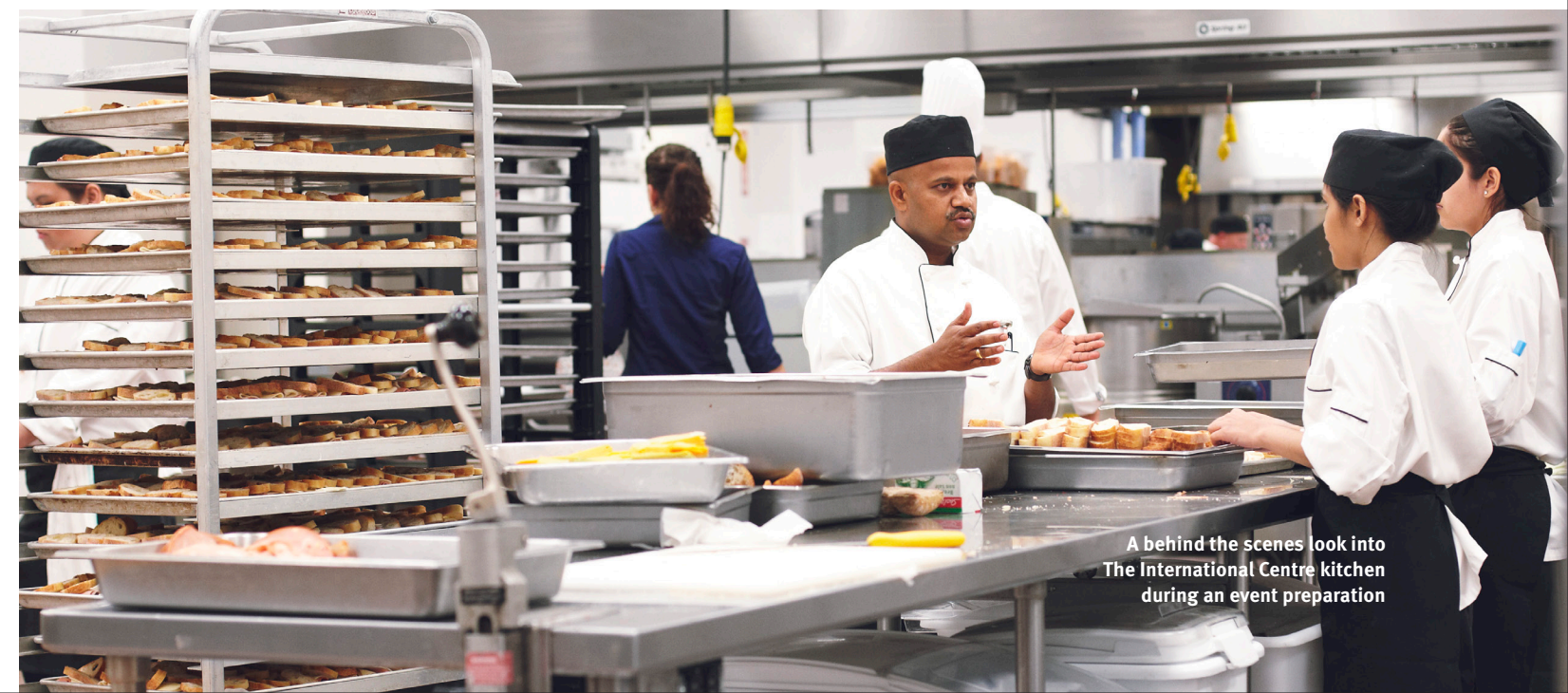
A behind the scenes look into The International Centre kitchen during an event preparation

For more information on Green Meeting Industry Council, please visit www.gmicglobal.org