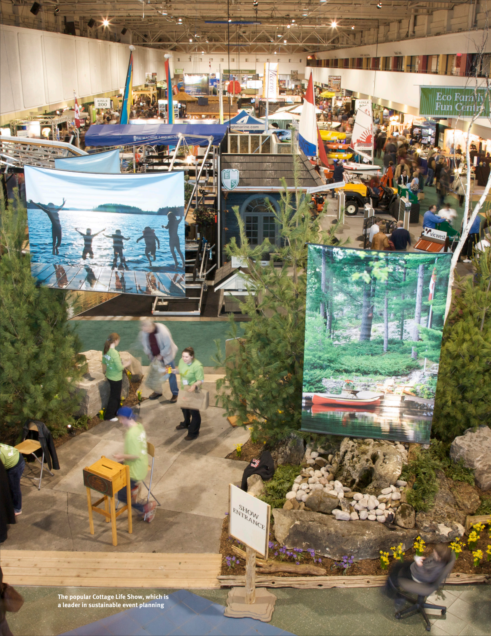
The popular Cottage Life Show, which is a leader in sustainable event planning